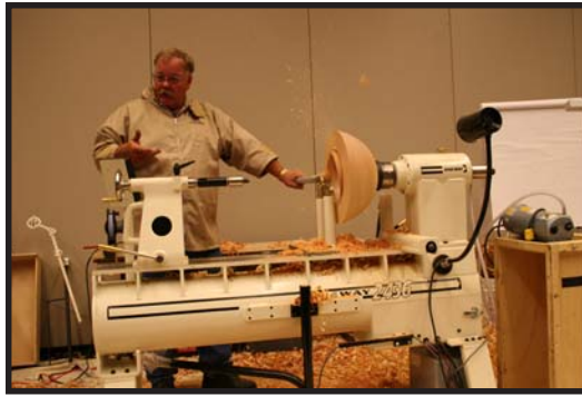
cont'd from page 1

The rotations included demonstrations from basic bowl turning to advanced hollow form turning, carving and coloring. Every demonstration left you anxious to get home and turn.